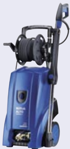
POSEIDON 3 XT