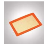
H.E.P.A. exhaust air filter