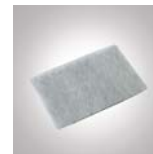
Activated charcoal filter for exhaust air