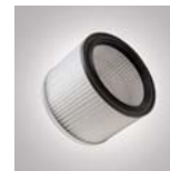
H.E.P.A. cartridge microfilter