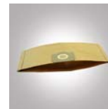
Double-layered paper filter bag