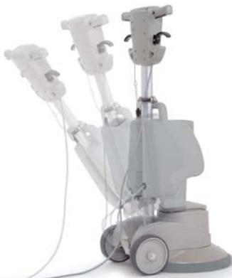
The operator can adjust the handle at any of the preset levels for best operating posture