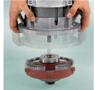
CM43F/50F plus - Steel gearbox for demanding cleaning tasks in extraordinary conditions