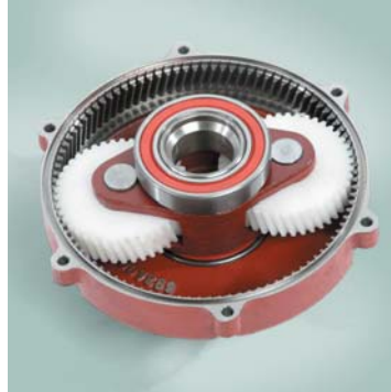
CM43F/50F - New gearbox with nylon gears for long life, high reliability and low noise operation