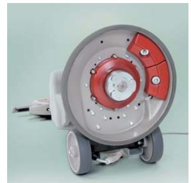
Controlled weight distribution for good balance so that use without causing operator fatigue is ensured