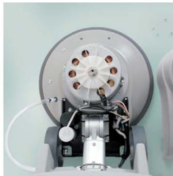
Powerful and heavy-duty motors (up to 2 Hp)