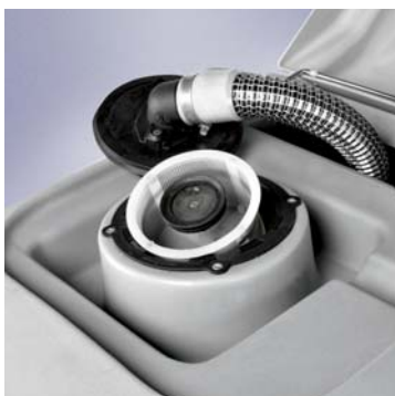
Removable suction filter for proper filter cleaning